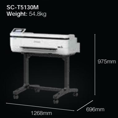
©2021 Epson India Pvt. Ltd. All Rights Reserved. Reproduction in part or in whole, without the written permission from Epson, is strictly prohibited. EPSON and EXCEED YOUR VISION are registered trademarks of Seiko Epson Corporation. All other product names and other company names used herein are for identification purposes only and are the trademarks or registered trademarks of their respective owners. Epson disclaims any and all rights in those marks. Print samples shown are simulations only. Specifications and product availability are subject to change without notice and may vary between countries. Please check with local Epson offices for more information.