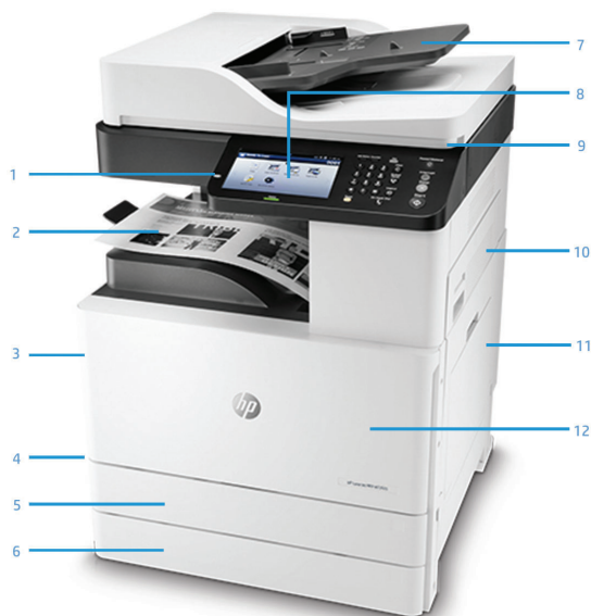
HP LaserJet MFP M72625dn