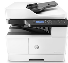
HP LaserJet MFP M438nda