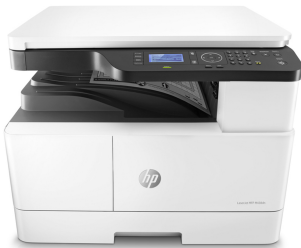
HP LaserJet MFP M438dn