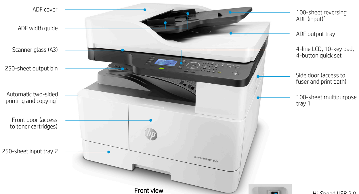
HP LaserJet MFP M438nda shown