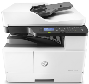
HP LaserJet MFP M438nda