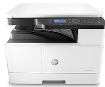
HP LaserJet MFP M438dn